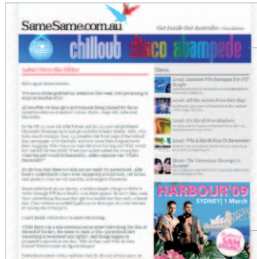
Same Same Newsletter