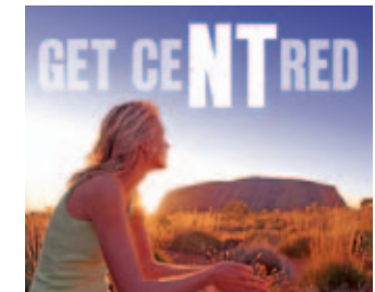
Tourism Northern Territory "Get CeNTred" (300 x 250px)