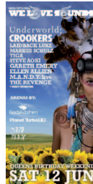
We Love Sounds (300 x 600px)