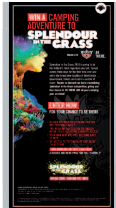
Smirnoff Splendour In The Grass